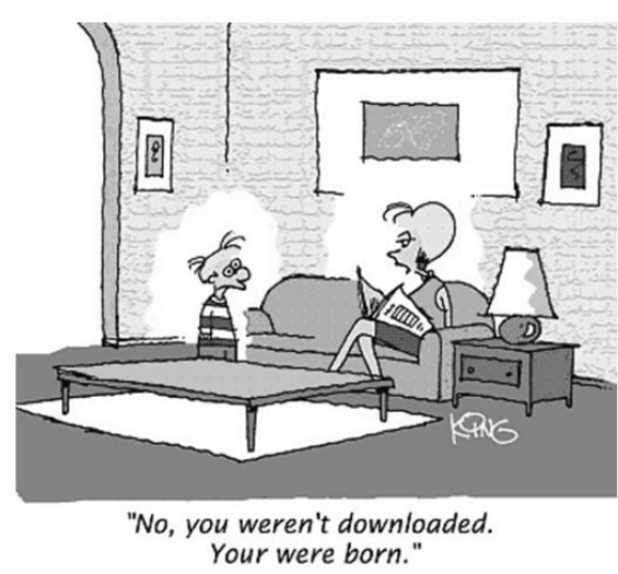
Figura 1. A typical figure

Figure and table captions should be centered if less than one line (Figure 1), otherwise justified and indented by 0.8cm on both margins, as shown in Figure 2. The caption font must be Helvetica, 10 point, boldface, with 6 points of space before and after each caption.