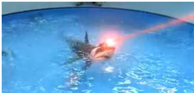
Figure 2: Example of a finished Shark Laser[5]